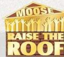
Lodge & Chapter Pin

"Moose – Raise the Roof" lapel pins are presented by your Lodge, Chapter or Moose Legion to members that sponsor their first member during this campaign.