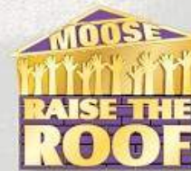
Moose Legion Pin