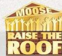
Lodge & Chapter Pin

"Moose – Raise the Roof" lapel pins are presented by your Lodge, Chapter or Moose Legion to members that sponsor their first member during this campaign.